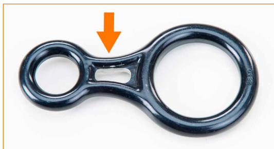
PHOTO APPENDIX FIGURE 8 BELAY DEVICE / DESCENDER